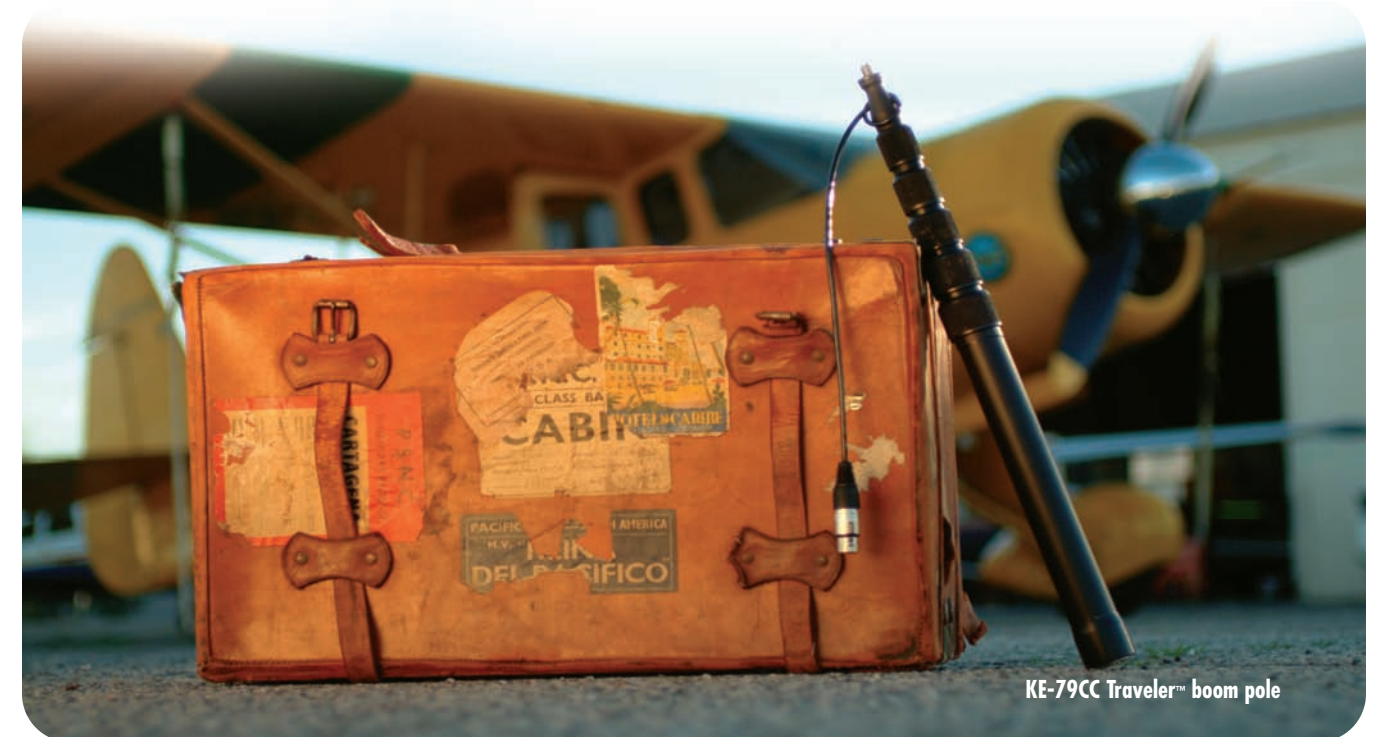
KE-79CC Traveler™ boom pole