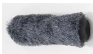
WSJ-23 Softie windjammer