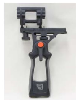
GS-23 Suspension handgrip