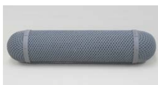
WS-4 Cage windshield