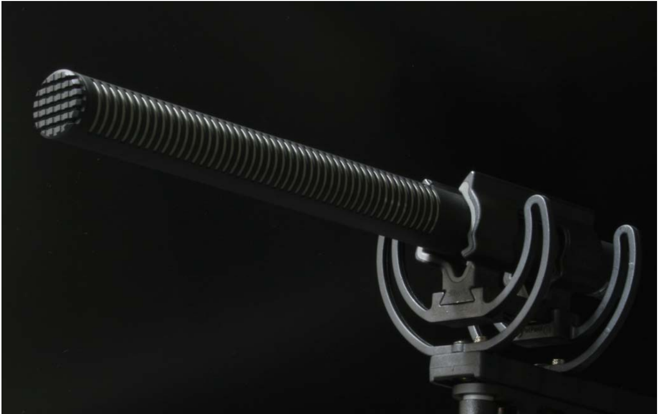
The suspension handgrip is an optional accessory.