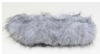
WJ-4 Windjammer for WS-4